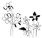
ORQUÍDEA PHALAENOPSIS EQUESTRIS + CATTLEYA TRIANAE