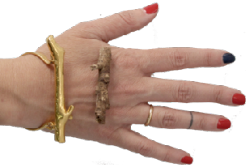
ACACIA BRACELET acacia baileyana mimosa