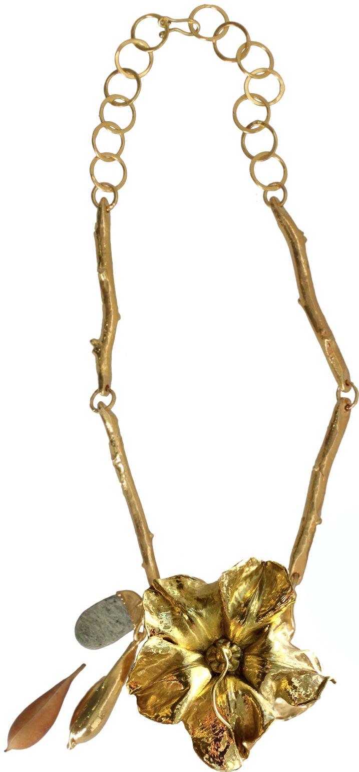
NECKLACE MIXED PENDANTS : ACACIA, HIEDRA MEXICANA, STONE, SEMILLAS PAJARITO acacia bayleiana mimosa, haedera helix, stone from Santa Marta river, crotalaria agatiflora