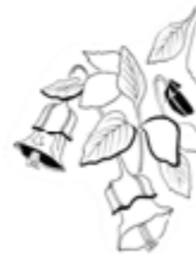
HIEDRA MEXICANA HAEDERA HELIX