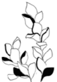
RUSCO RUSCUS HYPOGLOSSUM