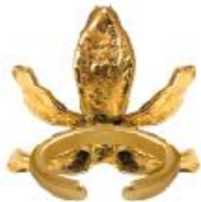
ORQUÍDEA RING cattleya