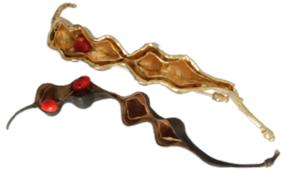
BROOCH CHOCOS adenanthera pavonina