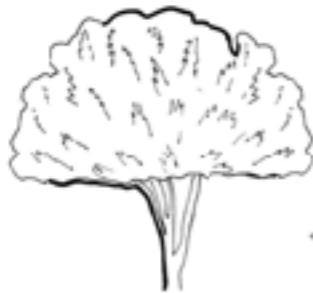
ACACIA / MIMOSA