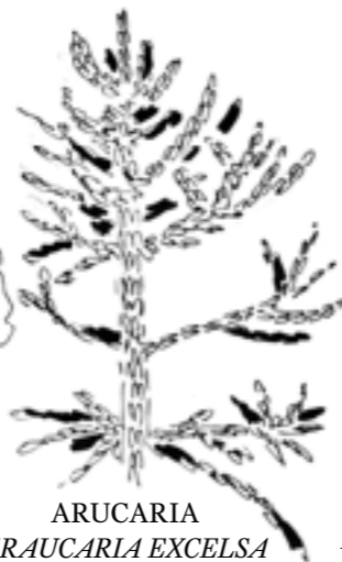
ARUCARIA ARAUCARIA EXCELSA