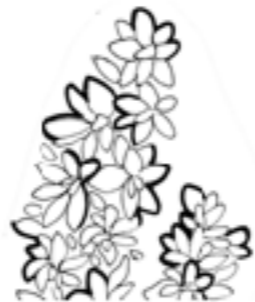
RODAMONTE ESCALLONIA MYRTILLOIDES