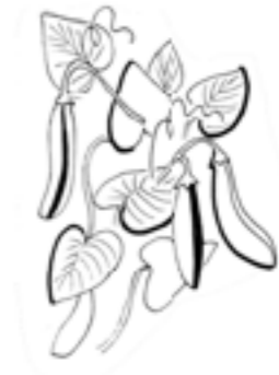
ARVEJA PISUM SATIVUM