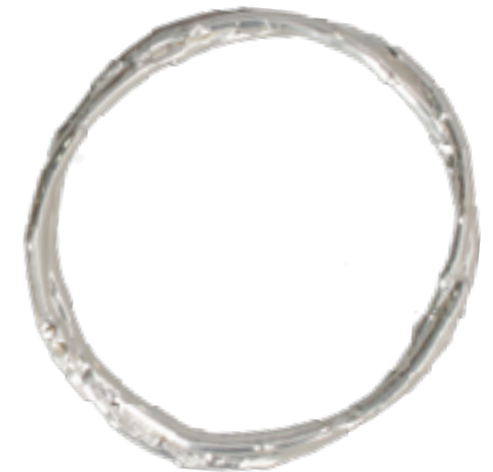
GOLD PLATED ACACIA BANGLE acacia baileyana mimosa