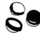
OJO DE BUEY MUCUNA URENS