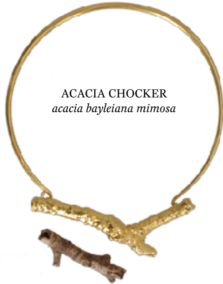
ACACIA CHOCKER acacia bayleiana mimosa